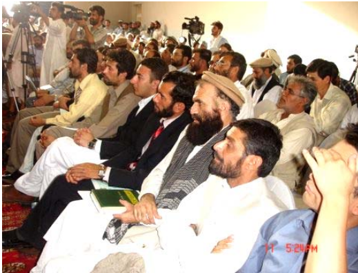
Participants in the official ceremony (more than 800 participants)