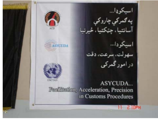
Afghan Customs Department/ ASYCUDA Poster