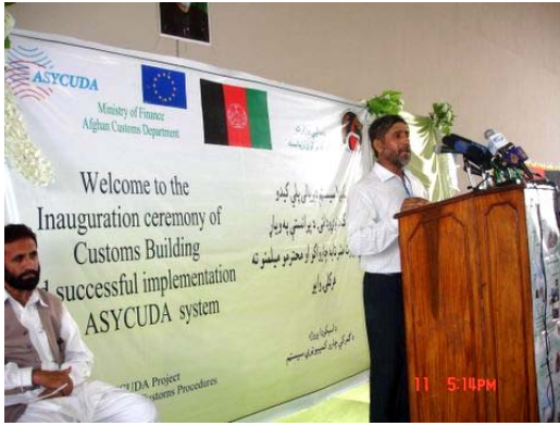
Representative of the Trade Community