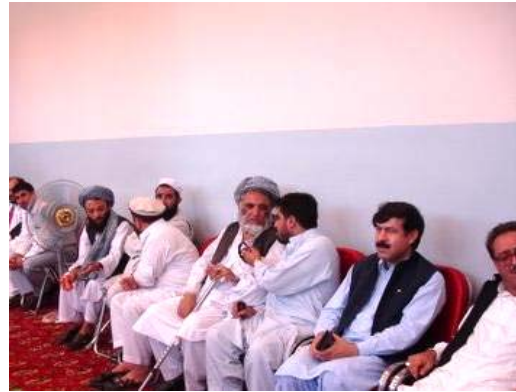
From right to left: Pakistan Gen. Counsellor in Afghanistan and the Chief Representative of the Central Government of Pakistan in the region