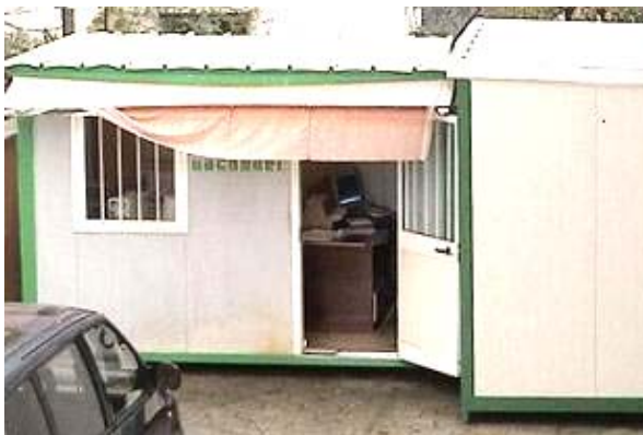
Customs Brokers' terminals