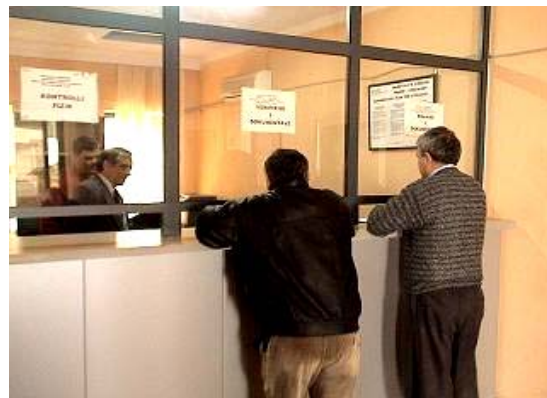
Interface with Customs Brokers