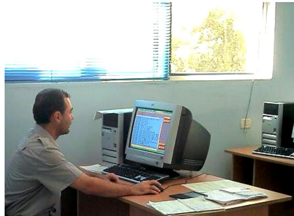
ASYCUDA Documentary Control Office