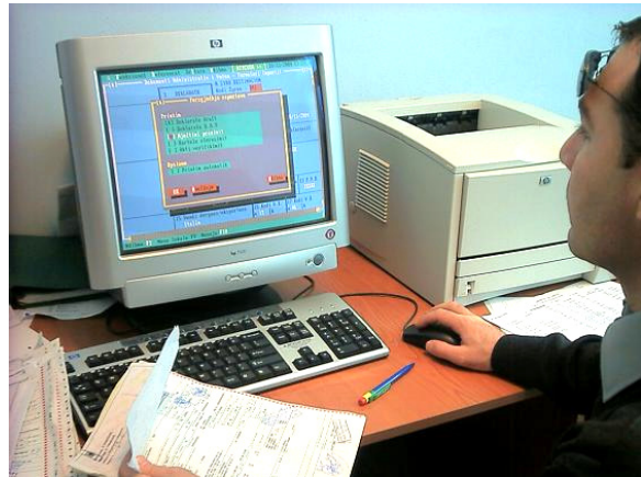
ASYCUDA Operational Office