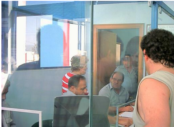
Interface with Customs Brokers