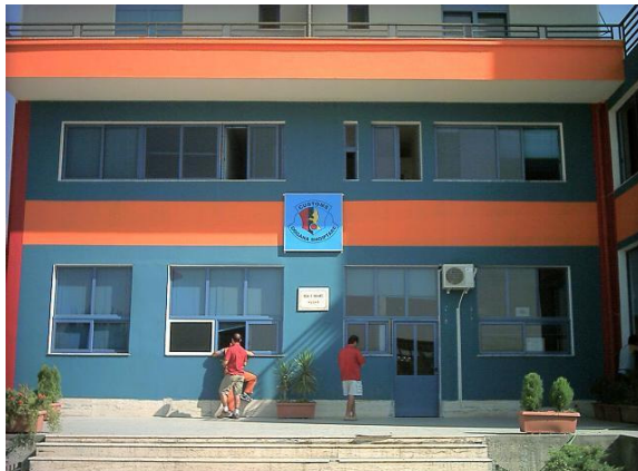
Vlora Customs Office