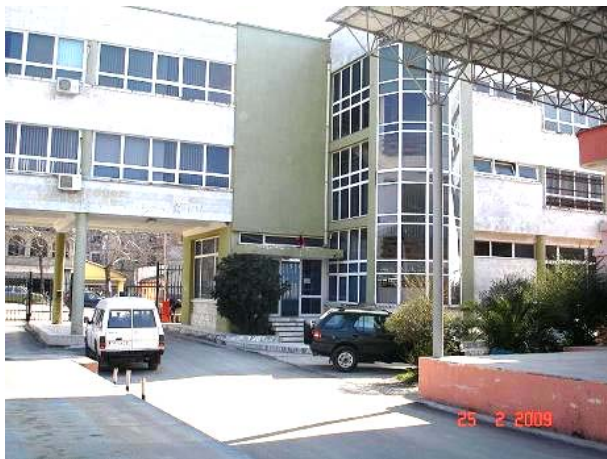
Elbasan Customs Office