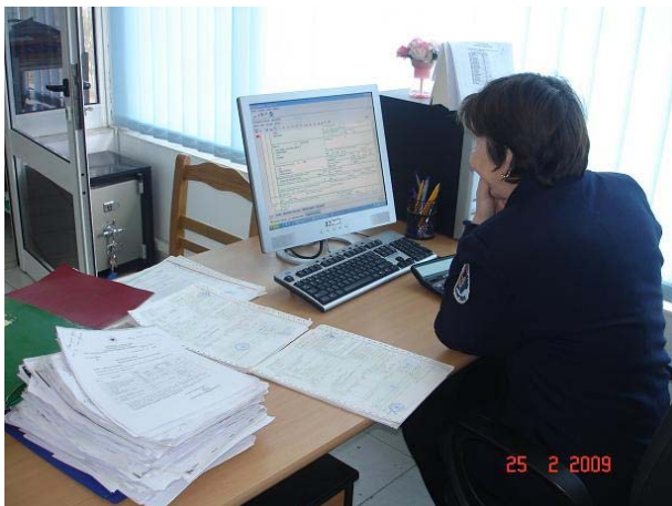
Customs officers using ACA AW system