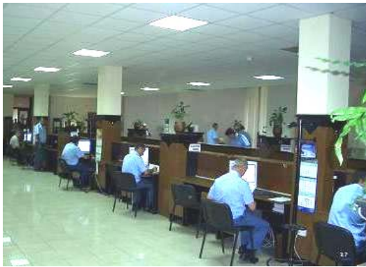
ASYCUDAWorld operational area