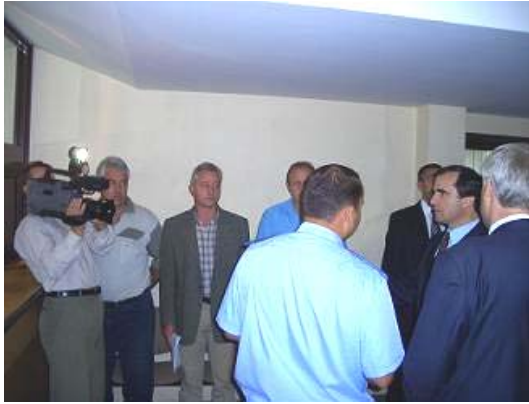
Discussions of the Prime Minister, Mr V.Tarlev, with Customs Brokers